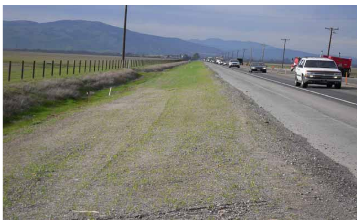
Stage 1 Hydro seeding