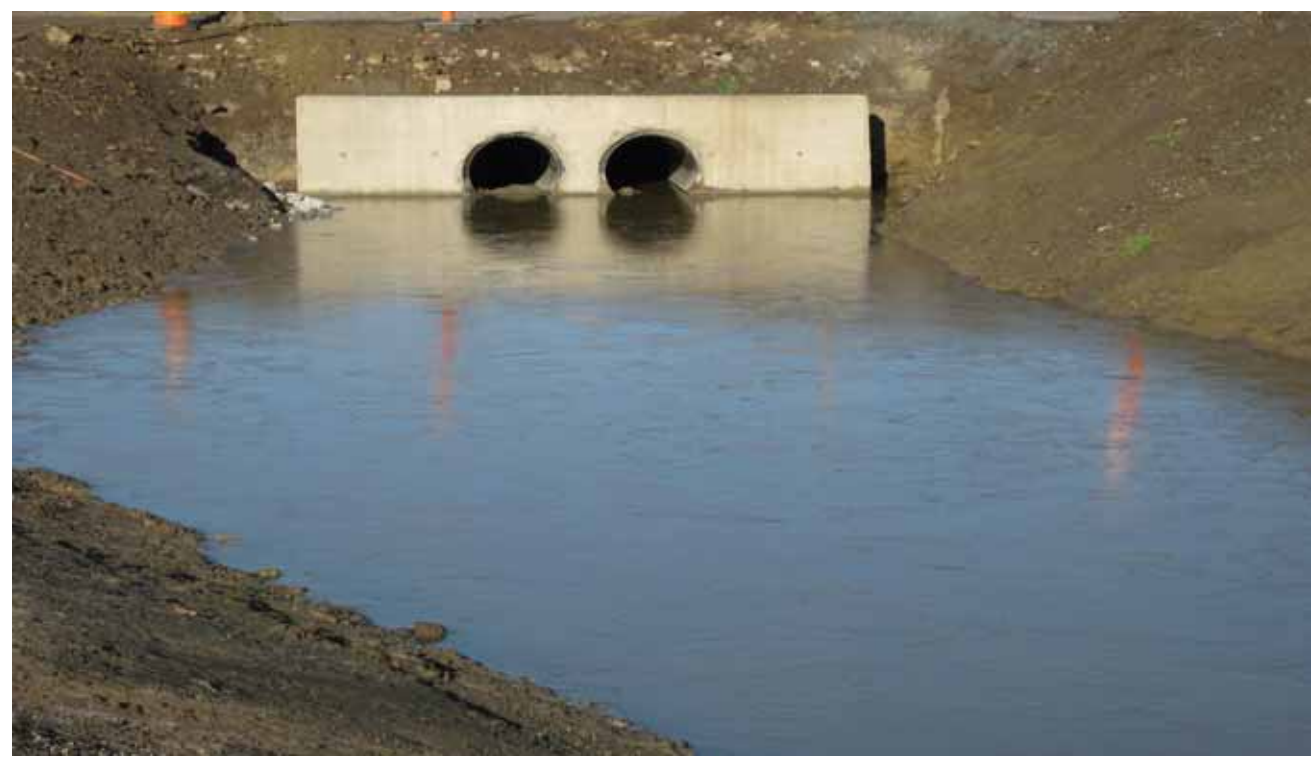
Drainage System at Shore Rd with new Headwall