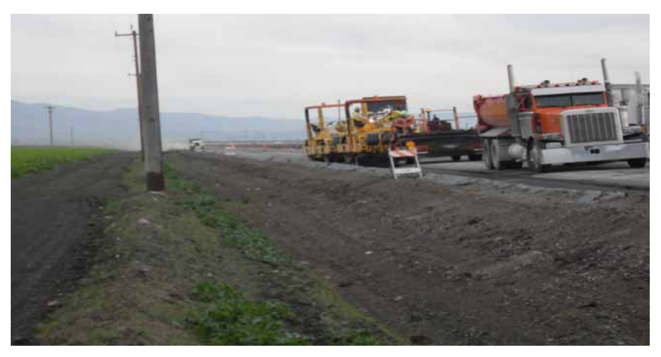
Paving Stage 2 Shoulder