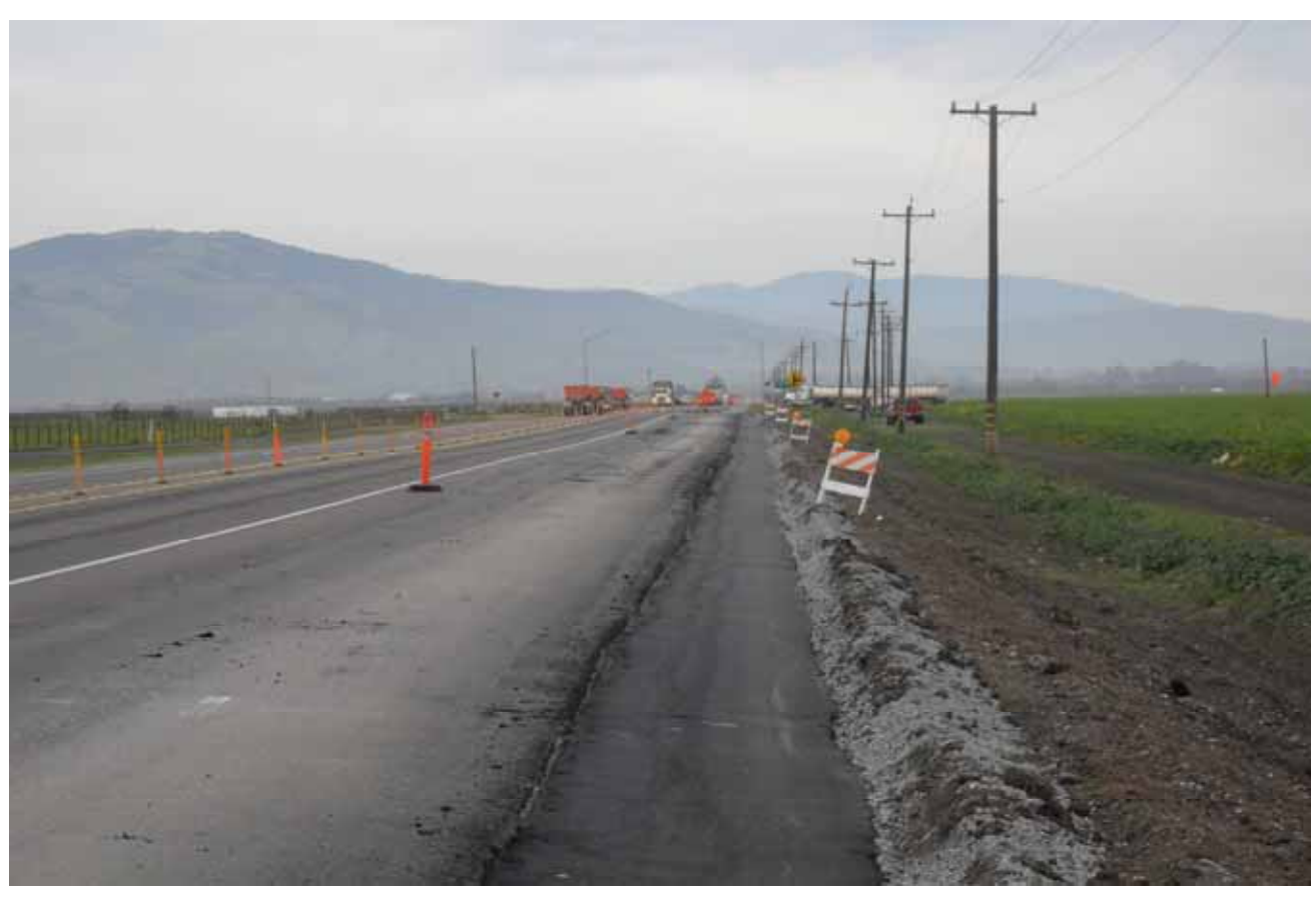
Shoulder Widening on Stage 2