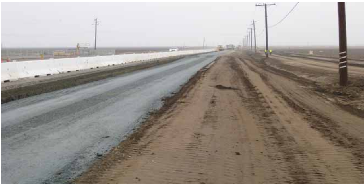
Embankment on Stage 2